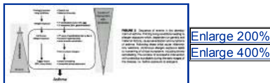
FIGURE 2 Sequence of events in the development of asthma. Priming living conditions leading to allergen exposure which, dependent on genetic and maternal factors, cause sensitization and symptoms of asthma. Following these initial acute inflammatory reactions, continuous allergen exposure leads to worsening of clinical symptoms, including airway remodelling. The window of successful intervention with probiotics is probably during the early stages of the disease, i.e. before exposure to allergens.

Expectations about developing probiotics to prevent or treat allergic diseases should remain realistic and consistent with the complexity of the studied situation, including the time point of disease progression (Fig. 2). However, even a partial but reproducible reduction of symptoms or decrease in the risk of allergy onset would correspond to an important contribution to the management of allergic manifestations.