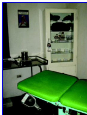
Figure 2. Interior of typical consultorio (primary care clinic).