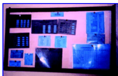
Figure 3. Epidemiologic data—including number of people with certain diseases, severity of diseases, birth outcomes and immunization rates—on wall of consultorio .

In Cuba, family physicians are required to look at patients in the context of family and community. Medical records are organized by family. Health statistics are recorded and reviewed on a regular basis. When consultorios lack technology, wall charts are used (Figure 3). As needs are identified, action plans are developed. Public health officials visit family physicians regularly to review and discuss their consultorio 's health statistics.