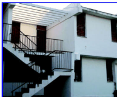
Figure 1. Exterior of typical consultorio (primary care clinic).

The current system of family medicine based in neighborhood consultorios (Figures 1 and 2) was established in 1984. Family physicians, paired with nurses, serve approximately 600 patients or 150 families in a defined geographic area surrounding their consultorio . The family physician and nurse live in housing units adjacent to their consultorio and are integrated into the community they serve. 5 Health promotion and disease prevention are emphasized, in that public health concepts are integrated with clinical practice. In the mornings, family physicians typically attend patients in their consultorio ; "afternoons are reserved for home visits to patients with acute care needs, rehabilitation of chronic conditions, and primary prevention." 6